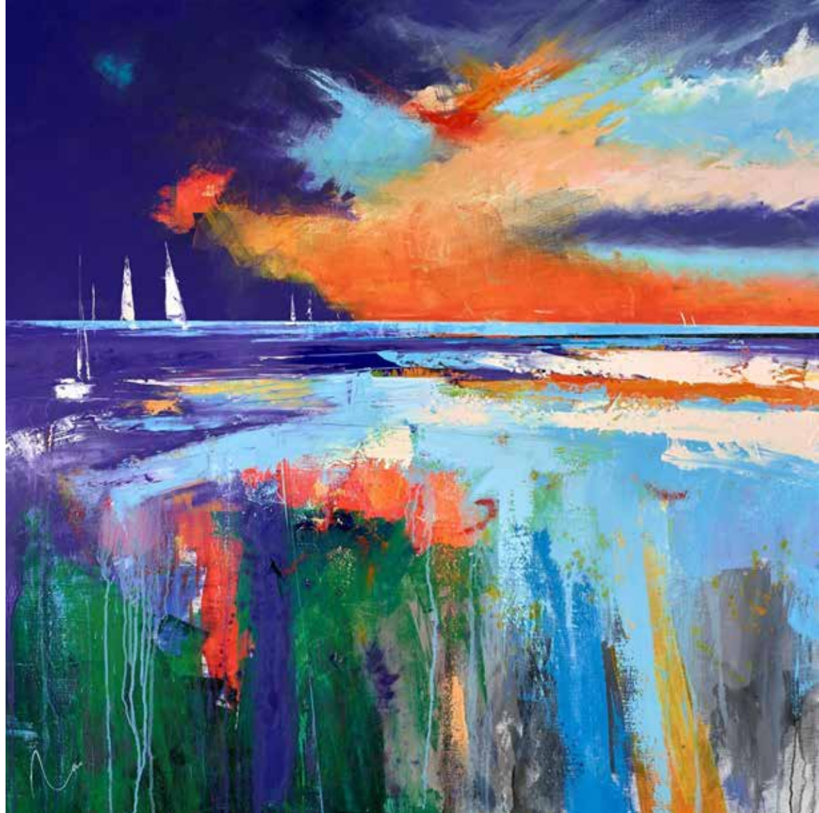
DEVON BLUE Oil on Canvas, 40 X 40", £3,595